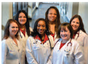
Physicians of the Deborah Women's Heart Center