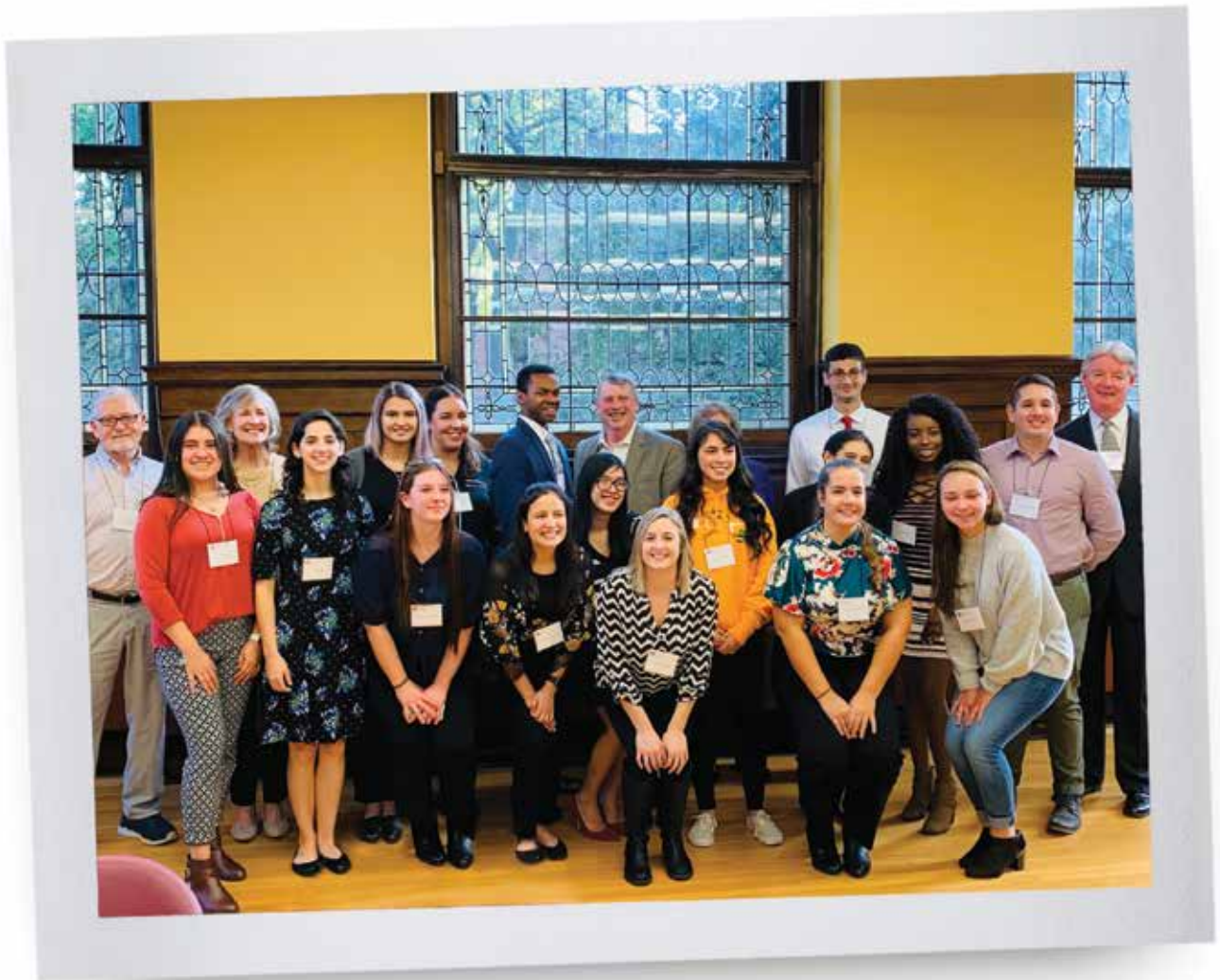
Recipients of The Snyder Foundation Scholarship Program with Foundation Board members at Award Reception October 2019.

The program has provided tuition assistance to several hundred college students totaling half a million dollars thus far.